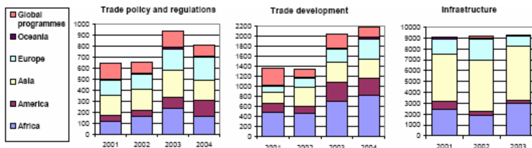
Figure 1: Distribution of trade-related technical assistance and infrastructure aid by region and main category, US$ millions

45. Since the launch of the DDA, trade-related assistance – as measured by the WTO/OECD-DAC Trade Capacity Building Database – has increased by roughly 50 per cent. 15 Aid committed to assist developing countries with trade policy and regulations (defined as activities dedicated to help countries reform and prepare for closer integration in the multilateral trading system) increased from $0.65 billion in 2001-02 to an average of $0.85 billion in 2003-04. In the same period, aid allocated to trade development (defined as activities that help create a favorable business climate) increased from $1.3 billion to an average of $2.1 billion per annum. Between 2002 and 2003, trade-related technical assistance and capacity building (TRTA/CB) rose from 3.6 per cent to 4.4 per cent of total aid commitments. This evolution – as well as related numbers of support for infrastructure – is captured in Figure 1.